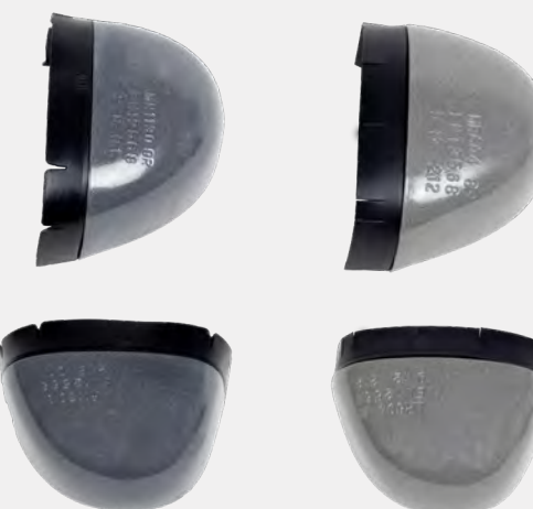
Sure Fit Toecap

Good Fit toe caps are available for sizes 4 to 8 (37 to 42).